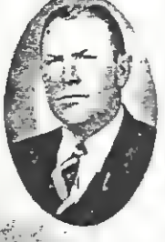
Theodore Hubler Garage - Service